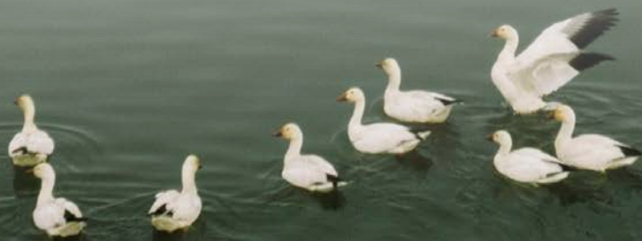
Snow Geese at Teshekpuk Lake Special Area in the Western Arctic.

Thanks for your continued commitment to and support for Audubon Alaska. Your hope for birds, wildlife, and the places they need motivates us every day. Forward we go! ■