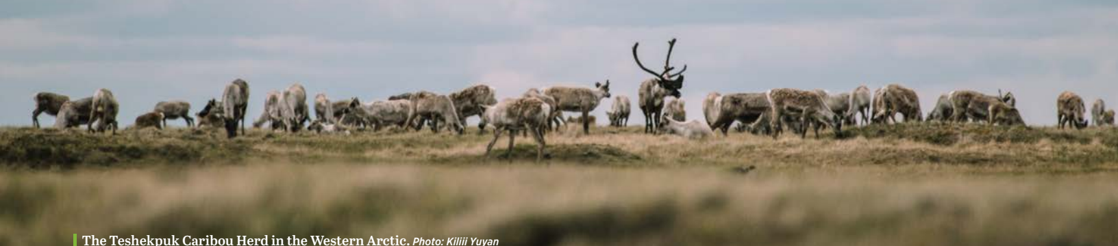
■ The Teshekpuk Caribou Herd in the Western Arctic.

Now Audubon's efforts are focused on delivering a final administrative rule that defines "maximum protection" for the Reserve's Special Areas. We are also working to develop new ways to better manage and steward this irreplaceable landscape. Stay tuned! ■