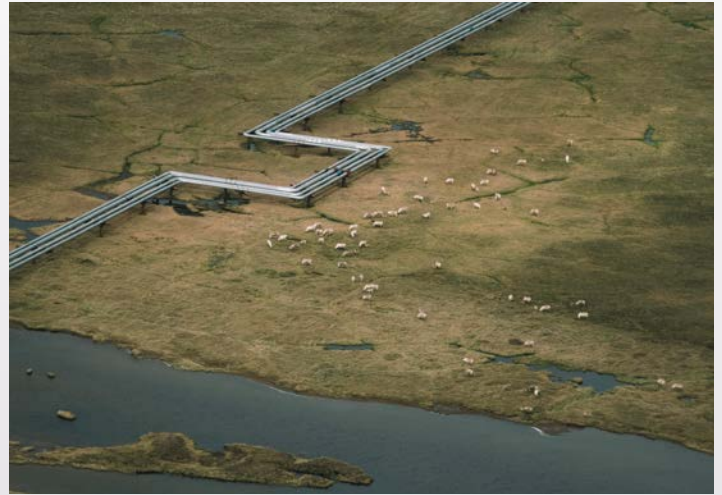
■ The Teshekpuk Caribou Herd near the Western Arctic Pipeline.

Also on September 6, the Biden administration initiated a new conservation rule that would strengthen protections for the 13 million acres of designated Special Areas and establish a process for creating additional Special Areas within the region, prompting a 90-day comment period. Recently, large oil and gas projects, including the Willow