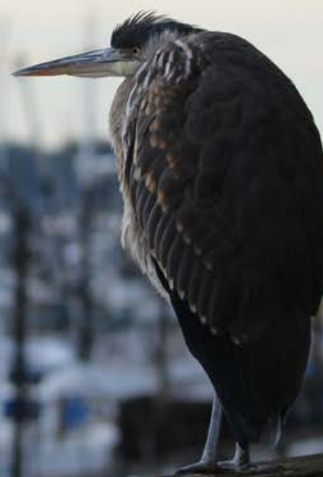
■ A Great Blue Heron in Ketchikan—a stop on the Southeast Alaska Birding Trail.