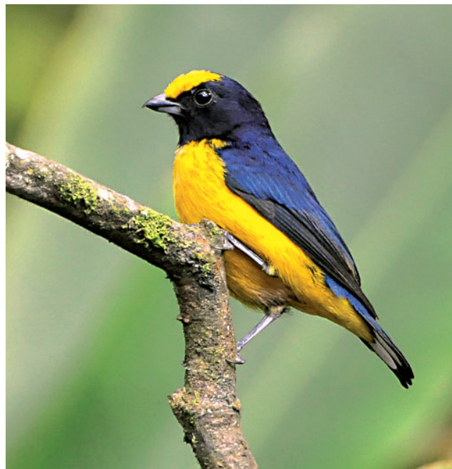
Clockwise from top right: Orange-bellied Euphonia and Red-headed Barbet.

Finca La Romelia is considered a top rate spot by birders who also are looking for different cultural experiences. It is a relaxing place, where the owners make you feel like one of the family. The house, furniture, and gardens are set up to give visitors a fantastic experience. The various orchids that adorn the entire house are a treat —this includes at the dinner table and at breakfast! You will be able to visit various trails in the orange groves and forest edge while a spectacular breakfast awaits you in the middle of your trip through the grove! Birding guides, also knowledgeable in orchids, are ready to show you the various spots on the trail best for viewing. They have found 188 species of birds here, in the hummingbirds you can see gems such as White-necked Jacobin, Green Hermit, Black-throated Mango, Western Emerald, Steely-vented and Rufous-tailed hummingbird, while in the orange trees you may find the Ultramarine Grosbeak and the Orange-bellied Euphonia. In the Guadua (bamboo) thickets it is possible to locate the Speckle-breasted Wren and the Jet Antbird.