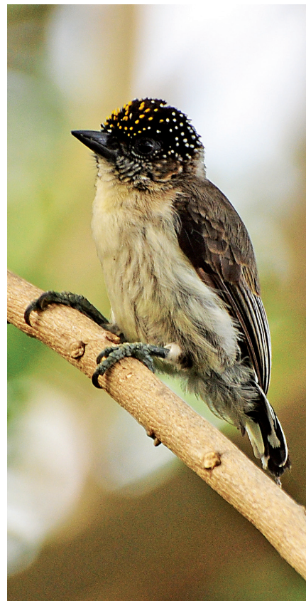
From top to bottom: Grayish Piculet. Turquoise Dacnis.

Not far from the Tinamú Reserve is the Camaguadua Reservoir. Used for fishing by the locals, particularly on weekends, there is an area upstream where birders may visit that is quieter. A variety of waterfowl may be found here, from Bare-faced Ibis, to wintering ducks including flocks of Blue-winged Teal at the right time of year. This reservoir is a nice spot to stop at and scan through, on the way south from Manizales.