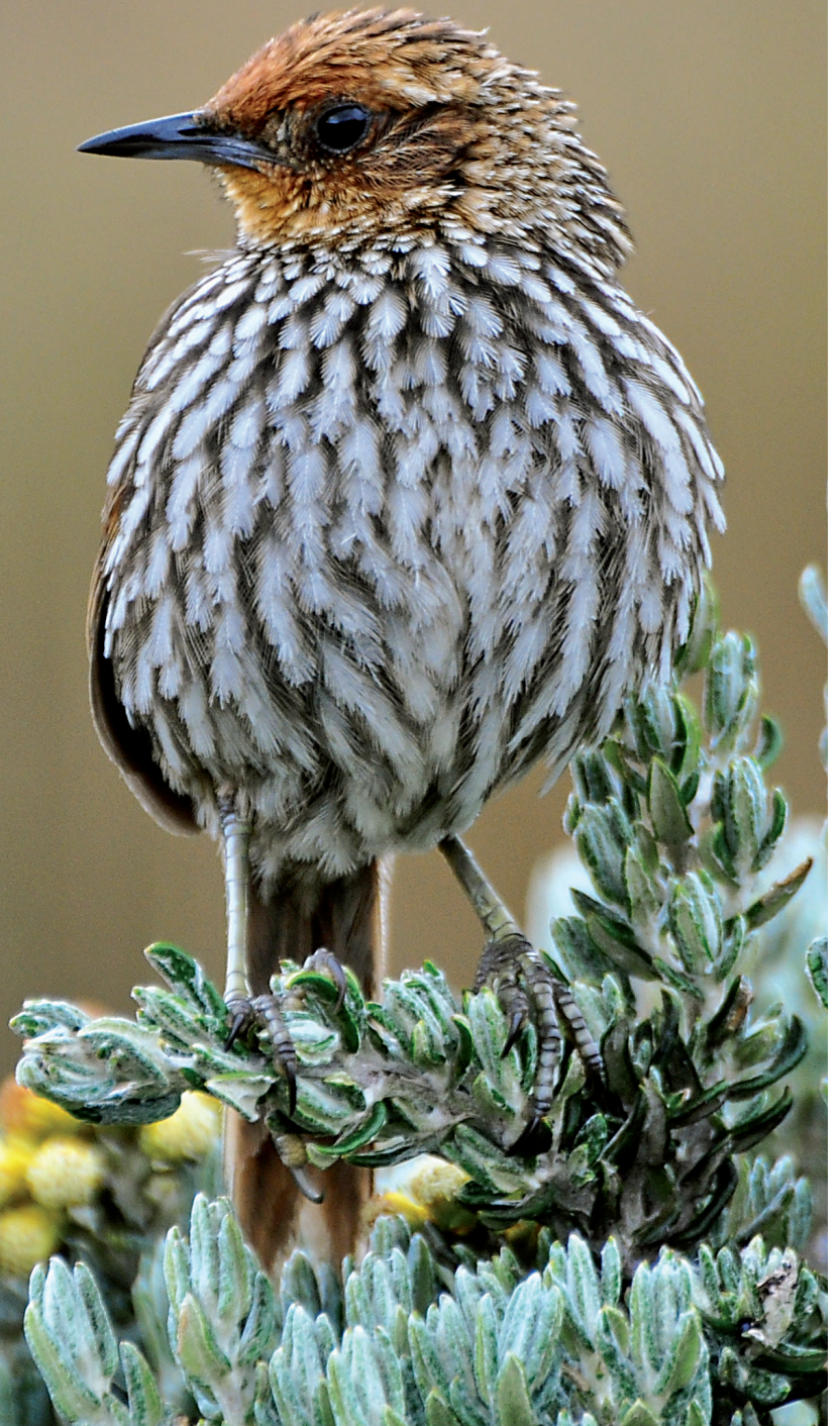
Many-striped Canastero.

The hills of the Central Andes in Colombia are rich with coffee and birds. Enjoy both while helping the surrounding communities conserve the incredible local natural heritage.