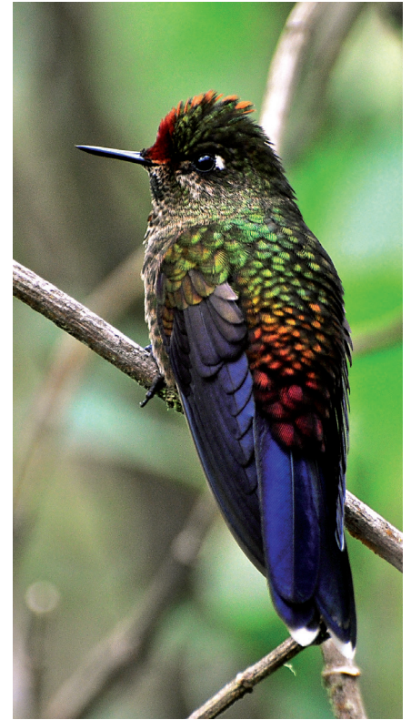
From top to bottom: Rainbow-bearded Thornbill. Wax Palm forest in Salento area.

Salento is an extremely popular destination with tourists. The charm of this town is irresistible, colorful and historical, and it is not difficult to understand why so many come here to see a bit of Old Colombia. Part of the appeal of Salento to many people is that it is nestled in the mountains, alongside the gorgeous Cocora Valley. There are many opportunities here for hiking, horseback riding, and enjoying nature. For the birder, the mix of agricultural land, rushing streams, montane forest and the rare Wax Palm Forests are the appeal. Over 245 species have been detected in the area. They range from large Sickle-winged Guans to tiny hummingbirds, such as Tourmaline Sunangel and White-bellied Woodstar, to Rainbow-bearded Thornbill and Golden-breasted Puffleg to showy little things like Booted Racket-tail and the impressive Long-tailed Sylph. All of them are gems on wings. In the Wax Palm forests of the highlands, Golden-plumed Parakeet can be found, and at times the rare Yellow-eared Parrot, as well as other more common parrot and parakeet species. The mixed species flocks here can include sightings of Montane Foliage-Gleaner, Pearled Treerunner, Blackburnian Warbler, Grass-green Tanager and up to five species of Mountain-Tanagers, and up to ten species of brightly colored Tangara tanagers – that is a lot of color in the forest! The gorgeous, unique and sought-after Torrent Duck can commonly be found here in the rushing streams.