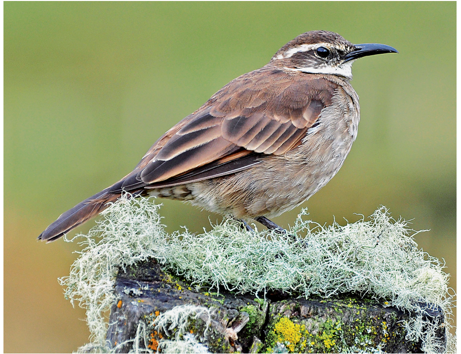
From top to bottom: Stout-billed Cincloides. Nevados National Park.

Starfrontlet, Collared Inca, Mountain Velvetbreast, Great Sapphirewing, and Shining Sunbeam. Perhaps not as vivid in color as its relatives, one hummingbird stands out for its bill. The Sword-billed Hummingbird has the longest bill length relative to its body of any living bird! The high elevation forests here also may provide Dusky Piha, the gorgeous Crimson-mantled Woodpecker, Golden-plumed Parakeet, and maybe mixed forest flocks with Black-capped Tyrannulet, White-banded Tyrannulet, Black-crested Warbler, Lacrimose and Scarlet-bellied mountain-tanagers, Golden-crowned Tanager, Blue-backed Conebill and maybe the uncommon prize of a Black-backed Bush-Tanager.