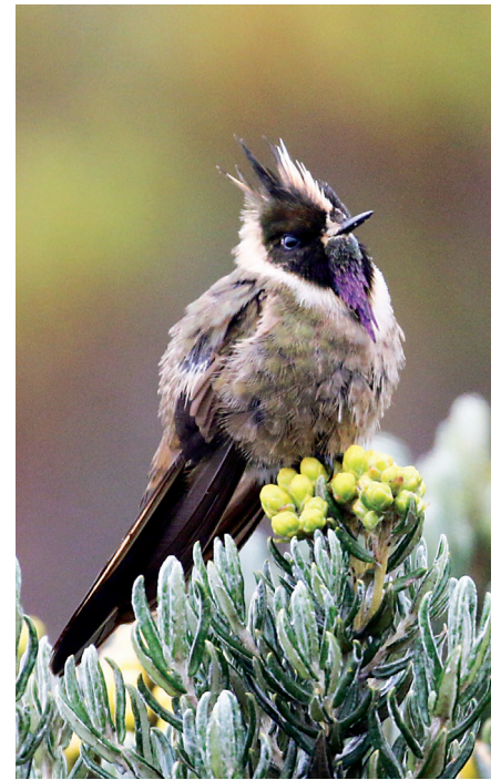
From top to bottom: Buffy Helmetcrest and landscape with Frailejones.

This will be our chance to visit the páramo, a high elevation habitat of grass, cushion plants, and unique vegetation found only in the high mountains. Los Nevados National Park is a high elevation park, largely above the tree line. It is an extensive park; we will visit the most easily accessible part of it. This region is also adjacent to montane forests at slightly lower elevation, such as the road that goes through the Bosques CHEC preserve on the way down to Manizales. The park is wild, and even the Spectacled Bear lives here, although one would have to be very lucky to see one. The local birds are high elevation-specialties, including the endemic and extremely charismatic Buffy Helmetcrest. This long-tailed hummingbird with a peaked crest is not only a rare and range-restricted bird, but also a habitat specialist. It is found in páramo rich “Frailejón” plants of the genus Espeletia . These are odd, large, hairy-leaved plants in the sunflower family that are only found in well-preserved páramo habitats. Up at these high elevations we may also find the Stout-billed Cincloides, Many-striped Canastero, Andean Tit-Spinetail, Veridian Metaltail, Black-chested Buzzard-Eagle, Plain-capped Ground-Tyrant, Andean Teal, Páramo Tapaculo and one of the easiest antpittas to find, the Tawny Antpitta. If you are lucky, the Andean Condor may sail by.