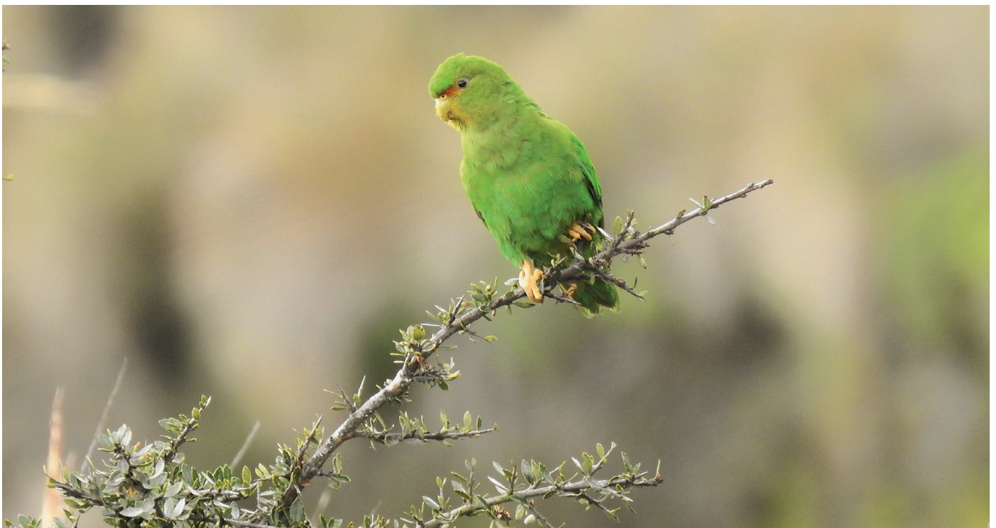
Rufous-fronted Parakeet.

While this itinerary is designed for the avid birder, it is also part of a process where birding becomes an active driver in economic development and ecotourism. You will visit project sites from a venture funded by the Colombian government implemented by the National Audubon Society to give economic value to birds and the habitats that sustain them. As part of this program, we have trained 60 birding guides in the areas we are visiting, in birding and guiding, and in English language skills. As these people become part of the birding economy, they are becoming ambassadors for their local environments, and key people who will convince their communities to conserve habitat rather than degrade it. This is conservation of birds and habitats, through bird-focused tourism.