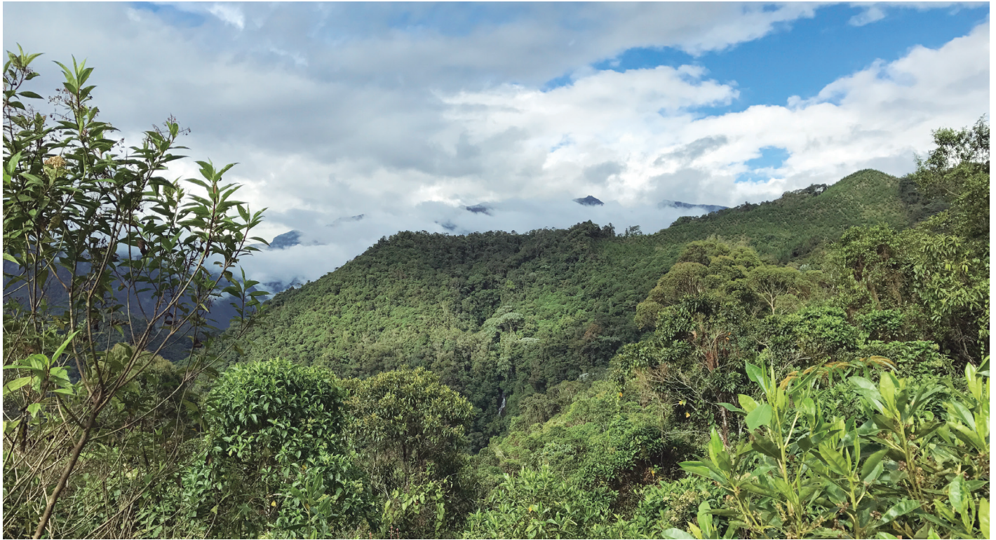
From top to bottom: La Patasola Reserve. Pearled Treerunner.

There are three areas we can go birding in the Salento Area. Continuing on the road above Salento is the “Camino Nacional.” Here one has access to large forest patches with great birding, as well as in the higher elevations the Wax Palm forest, the national tree of Colombia. In the highlands, a stop at a local finca will allow us to see some of the birds coming to their various hummingbird feeders while we enjoy a local cup of coffee or aguapanela (sugar cane drink). Across the valley from Salento is the reserve of Patasola, where great forest can be visited and sometimes nice mixed foraging flocks of birds are found. The Cocora valley itself is another great birding area that includes the rushing river that has created this scenic valley. The Reserva El Cairo includes a very comfortable and well-reviewed hotel. The nature reserve of El Cairo has a checklist of over 140 species and can be used as a base for visiting the area.