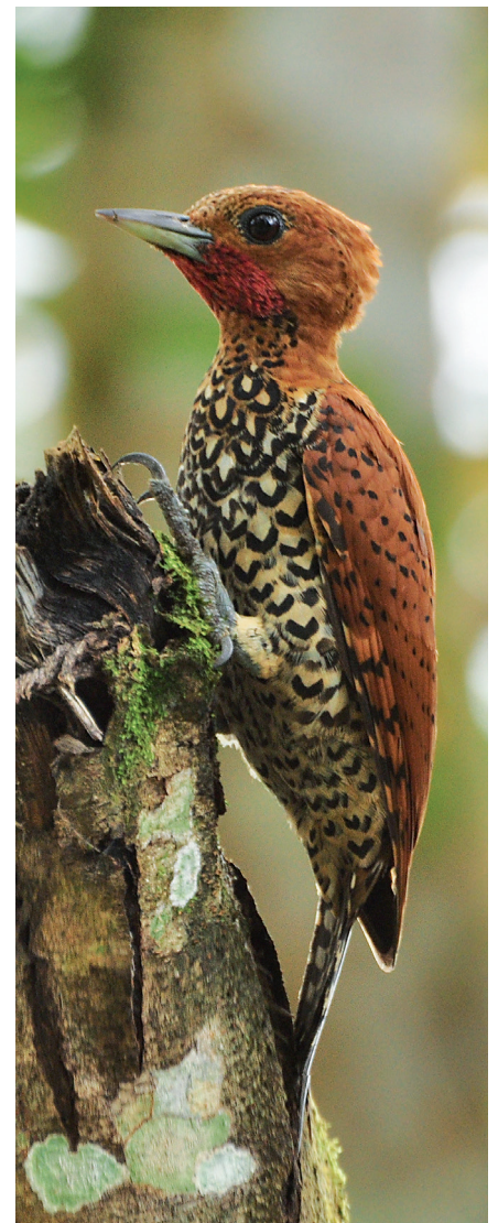
From top to bottom: Beautiful Woodpecker. Cinnamon Woodpecker.

Interestingly all three of the world's Ani species can be found here, being black and lacking bright colors they are not species that people tend to think of that much. However, they are extremely interesting in their communal life style, where several males and females mate willy-nilly and all help in the care of the eggs and young - a hippie commune of the bird world. Here you can test your identification skills telling the three apart.