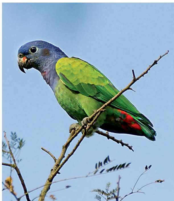
From top to bottom: Blue-headed Parrot and Wattled Jacana.

In the forest are various birds of interest. In the canopy, the range-restricted and endemic Turquoise Dacnis can be found here. The male is a beautiful sky-blue bird with a black mask and bright yellow eyes. Blue-headed Parrots can be seen flying overhead, and on the forest floor, the Black-billed Thrush is common, and it may share the area with the seldom seen but commonly heard Scaled Antpitta.