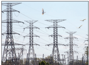
Great Egrets

500,000 to 1 million birds killed per year