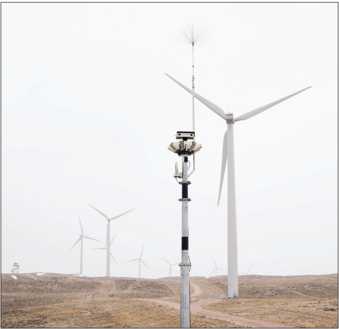
At Duke's Top of the World wind farm outside Casper, Wyoming, an IdentiFlight unit scans the horizon for raptors. Its AI software can pick out eagles at risk of collision and trigger a turbine curtailment.