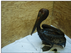
Oiled Brown Pelican

Up to 7 million birds killed per year from collisions