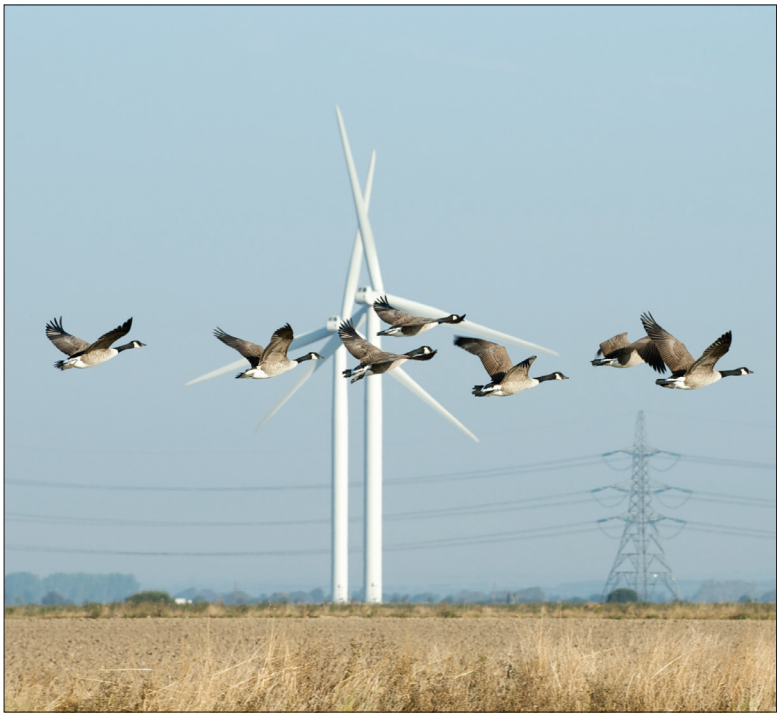
Canada Geese