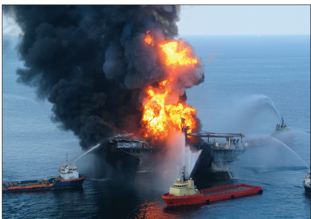
Deepwater Horizon