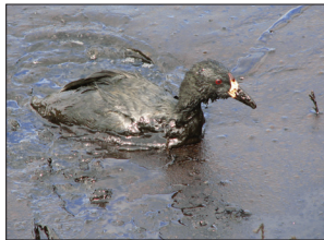
American Coot