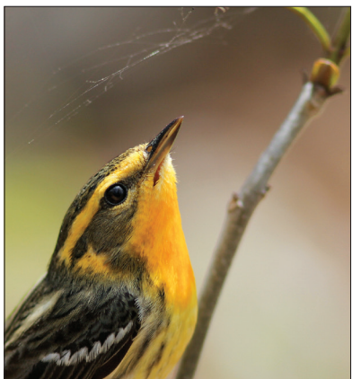
Blackburnian Warbler