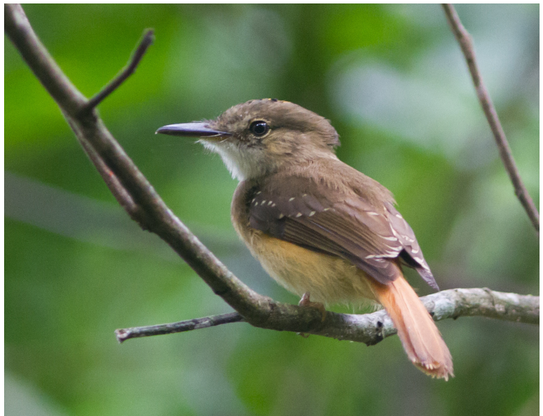
Northern Royal Flycatcher.

This 128,000-acre sanctuary, set near a pure Mayan community, was formed in 1990 as a preserve for a large population of Jaguars, and over 330 species of birds and other biodiversity. Fortunately, the forest has well-maintained trails that allow us entry into a world of dense lowland forests. Many birds can be found in the clearing around the headquarters and we will look carefully for Crested Guans, Northern Royal Flycatchers, Golden-hooded Tanagers and others. Because of the high biodiversity associated with lowland rainforests, we have a chance to see a great number of tropical species restricted to this habitat. Especially exciting are the mixed species flocks that can exhilarate and overwhelm us at the same time. Standing in the middle of the path of a flock is a highlight for many birders. Most of the trails start at the headquarters and loop back thereby allowing