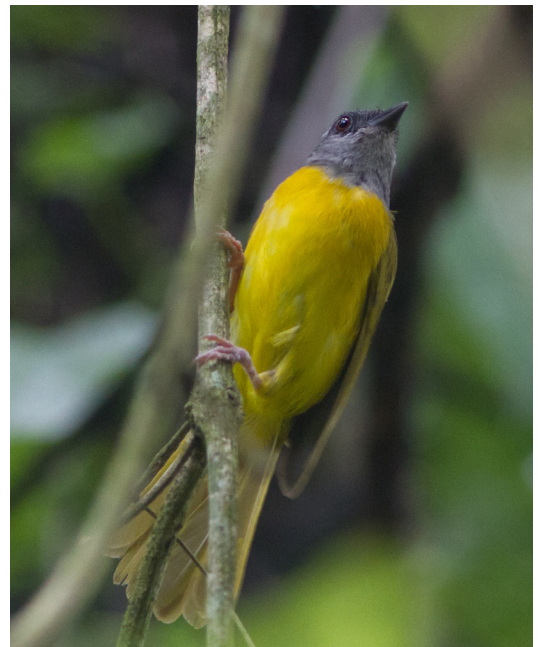
Gray-headed Tanager.

and Yellow-billed Cacique . Access to the Guacamayas Research Station—where we will stay overnight—is by boat along the San Pedro River, as is the trip farther on to the Waka Peru archaeological site. The wetland habitats along the river banks are more extensive than in nearby areas frequented by birders. Along the river, we may see Amazon and Green kingfishers, Mangrove Swallows and Black-collared Hawk . Despite serious deforestation in the western Petén, the area of Laguna del Tigre National Park near Paso Caballos and Waka Peru is an area of fantastic lowland tropical forest, a place where a Crested Guan may call from the trees, or where a Great Curassow may walk across the trail. Jaguars are here , although difficult to see. At least eight species of woodcreepers are found here, as well as huge Lineated and Pale-billed woodpeckers , several species of trogons, Blue-crowned Motmot and a myriad of wintering migratory warblers and tropical flycatchers. But the prize bird is the fantastic