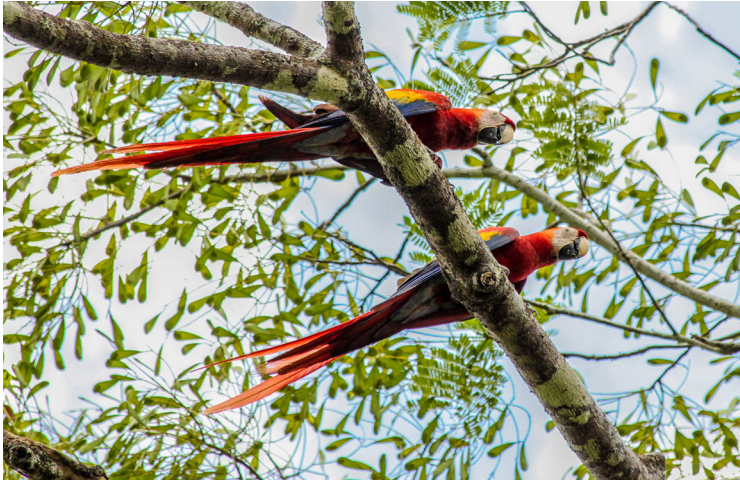
Scarlet Macaw.