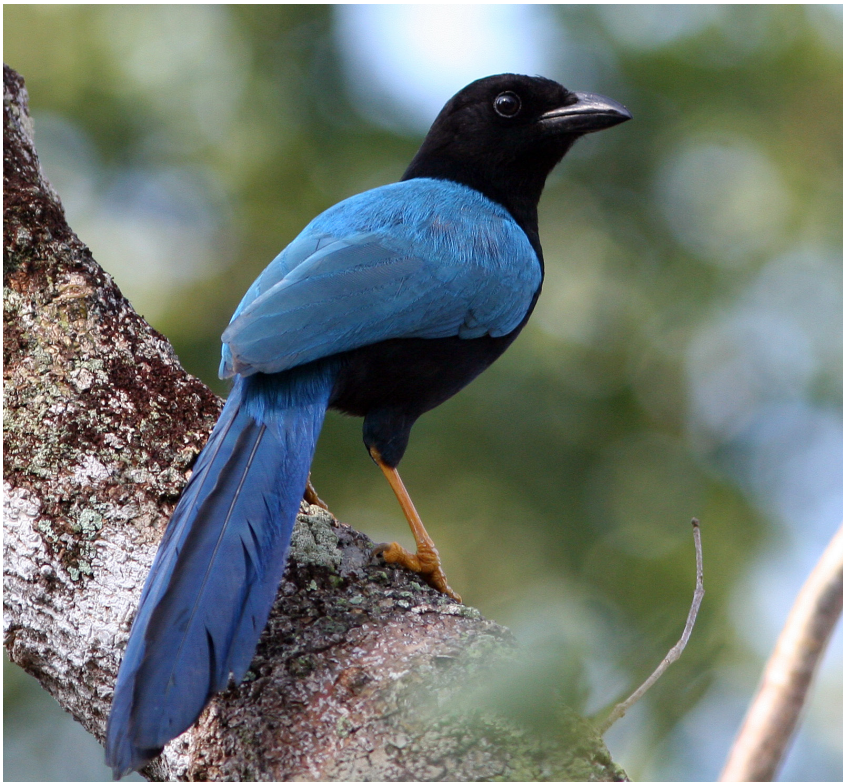
Yucatan Jay.

waterfowl . Along the forest and savanna trails, Aplomado Falcon, Yellow-lored and Yellow-headed parrots, Canivet's Emerald, Yucatan Woodpecker, Yucatan Jay, and Rufous-browed Peppershrike are among the many species that we will seek out. Being around what is considered the oldest village in Belize and the local birding guides will enable us to interact with the local people and their culture.