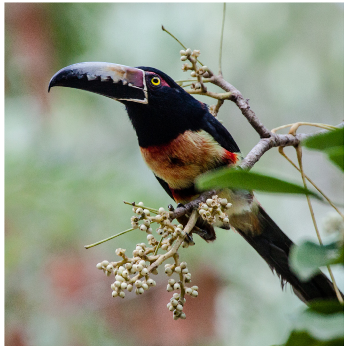
Collared Aracari.

Day 9 – PASO CABALLOS. Within Laguna del Tigre National Park, we will bird the Guacamayas Biological Station and may have an opportunity to visit El Peru archaeological site. Great, Thicket and Little tinamous may be heard in