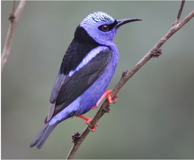
Red-legged Honeycreeper.

Day 7 – POOK’S HILL. In the morning we will explore the trails on the private preserve, looking for Agami Heron, Pheasant Cuckoo, Tody Motmot, Ferruginous Pygmy-Owl, Rufous-tailed Jacamar, Northern Royal Flycatcher, Gray-headed and Crimson-collared tanagers among the many forest species known from the area. After lunch, we will explore the Belize Botanical Gardens and trails at duPlooy’s Jungle Lodge along the Macal River Valley. Overnight at duPlooy’s Jungle Lodge.