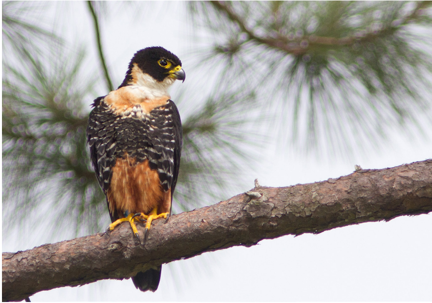
Orange-breasted Falcon.

Scarlet Macaw , not common in the Petén, yet this is one of the best areas to find it at certain times of the year.