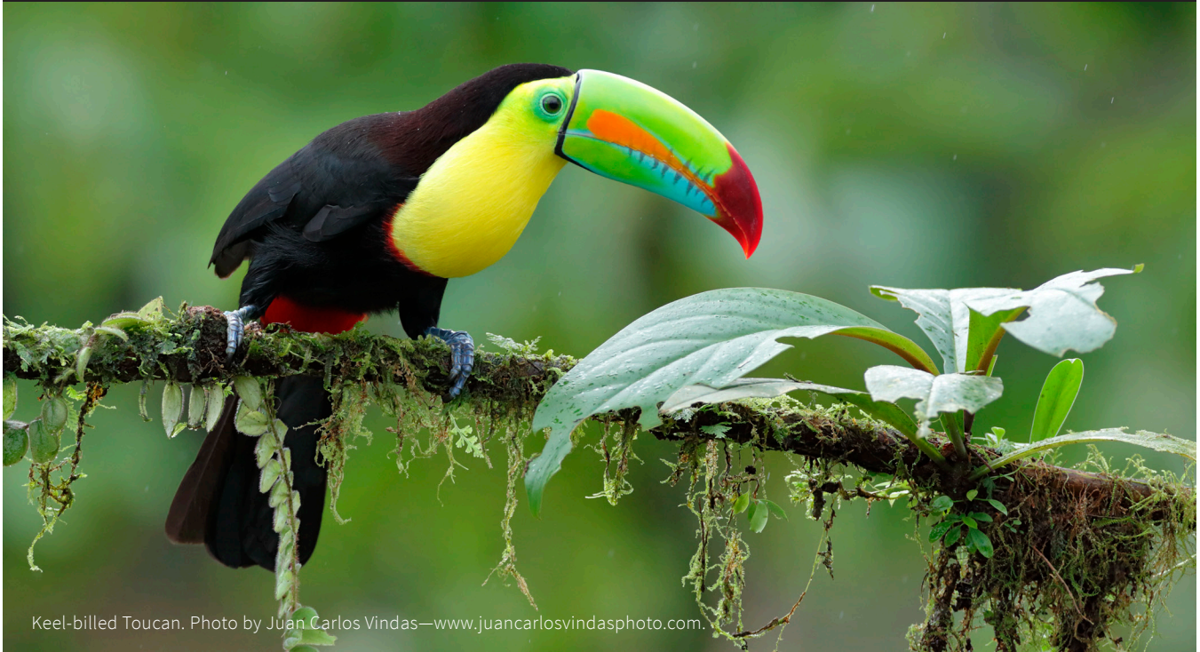
Keel-billed Toucan.