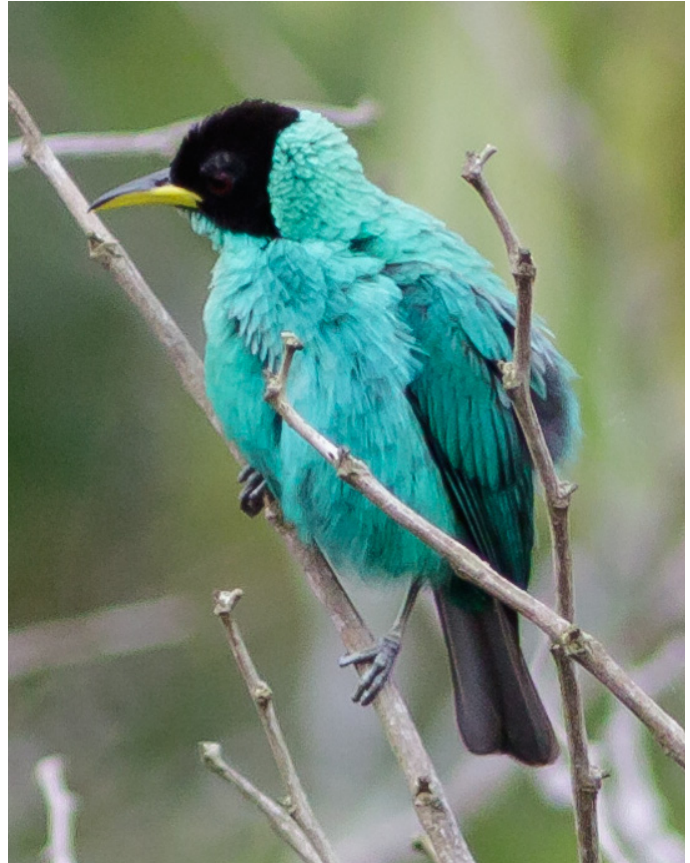
Green Honeycreeper.

Day 6 – COCKSCOMB BASIN WILDLIFE SANCTUARY/POOK'S HILL. We will spend the morning in the sanctuary exploring trails not covered in the previous day. We will focus on finding new species for the trip and better looks at familiar species. In the afternoon we will drive to Pook's Hill for late afternoon birding. An optional night walk may yield Black-and-white or Spectacled owls. Overnight in Pook's Hill.