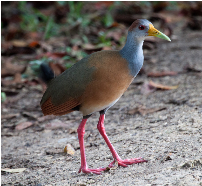
Gray-necked Wood-Rail.

Day 10 – PASO CABALLOS TO YAXHÁ. Not as well-known as Tikal, Yaxhá is an important archaeological site, which is gaining prominence as researchers delve deeper into its history. The area is part of the Yaxhá-Nakúm-Naranjo National Park which protects the archaeological sites as well as a large expanse of forest. Here, large flocks of several species of parrots move through the area early and late in the day, including Red-lored, White-fronted, White-crowned, and (less often) Mealy . The nearby lake provides habitat for waterbirds as well as shorebirds during migration; in open savanna along the shores of the lake, we may find Yellow-tailed Orioles . In the forests of Yaxhá, we can find a diversity of woodcreepers, Slaty-tailed, Gartered and Black-headed trogons, hummingbirds and tanagers . Overnight in Yaxhá, El Sombrero Ecolodge.