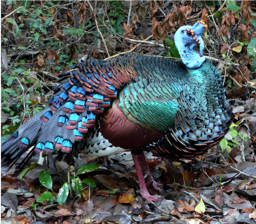
Ocellated Turkey.

birding areas that Belize/Guatemala has to offer. Of the almost 600 species found in Belize and the Petén , many of the great birds we will be seeking are difficult to find anywhere in their ranges, some of which are restricted to Belize and adjacent countries. This region also sits within the migratory or wintering range for many migratory songbirds and waterbirds . Here we will watch them in their wintering habitats and see how different their ecology is compared to their mainland breeding grounds in the United States and/or Canada. Our shared struggle to conserve these migratory birds becomes obvious and immediate, and through birding tourism we take a small step to making a statement of the value of bird habitat as a business opportunity.