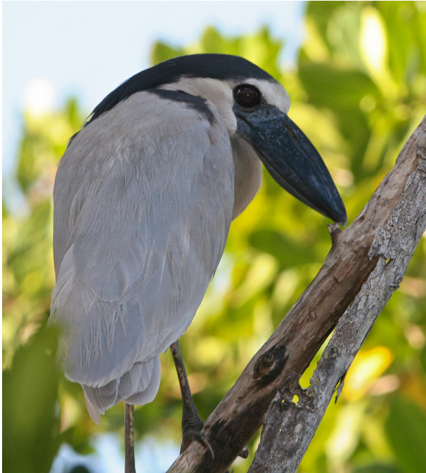
Boat-billed Heron.

WCS provide technical assistance, education, health and educational infrastructure. As such, the local community is invested in trying to promote ecotourism in their region and some members are being trained as birding guides by the Audubon and WCS.