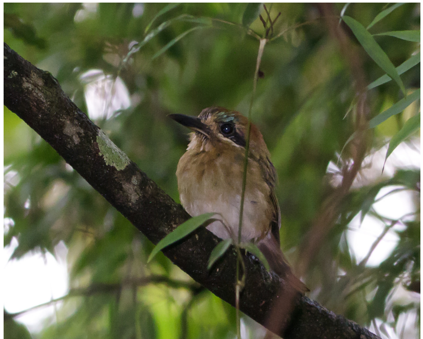
Tody Motmot.

Day 2 – CROOKED TREE WILDLIFE SANCTUARY. Today we will bird the extensive waterways of this 44,000 acre RAMSAR site where we hope to see a mix of herons, ibis, Roseate Spoonbills, Northern Jacanas, Boat-billed Herons and Jabiru . After lunch we will explore the Pine Savannas where we hope to find the near-endemic Yucatan Jay, Rufous-browed Peppershrike, Yellow-headed and Yellow-lored parrots, Aplomado Falcon, Canivet's Emerald, and Yucatan Woodpecker . An evening walk will be available for those who hope to catch up with a Common Pauraque, Mottled Owl or