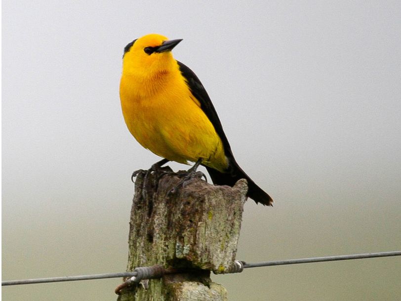
Saffron-cowled Blackbird.

the swath of Chaco and Cerrado savanna, woodlands, and grasslands is important as it explains much about the evolutionary history of the birds in South America. The mix of habitats holds a large number of species, with some unique and memorable regional specialties!