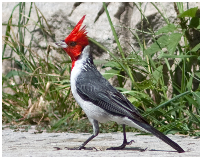
Red-crested Cardinal.

are represented by some unusual ones, such as the rare Russet-winged Spadebill . The Sharpbill , a species that at one time was the only species in its family, is also found here. The list is rounded out with Black-capped Foliage-Gleaners , Chestnut-bellied Euphonia , Rufous-crowned Greenlet , a variety of hummingbirds, Buff-bellied Puffbird , Rusty-breasted Nunlet and the garrulous Red-rumped Cacique to name a few. Night birding opportunities are available, with Black-capped Screech-Owl ,