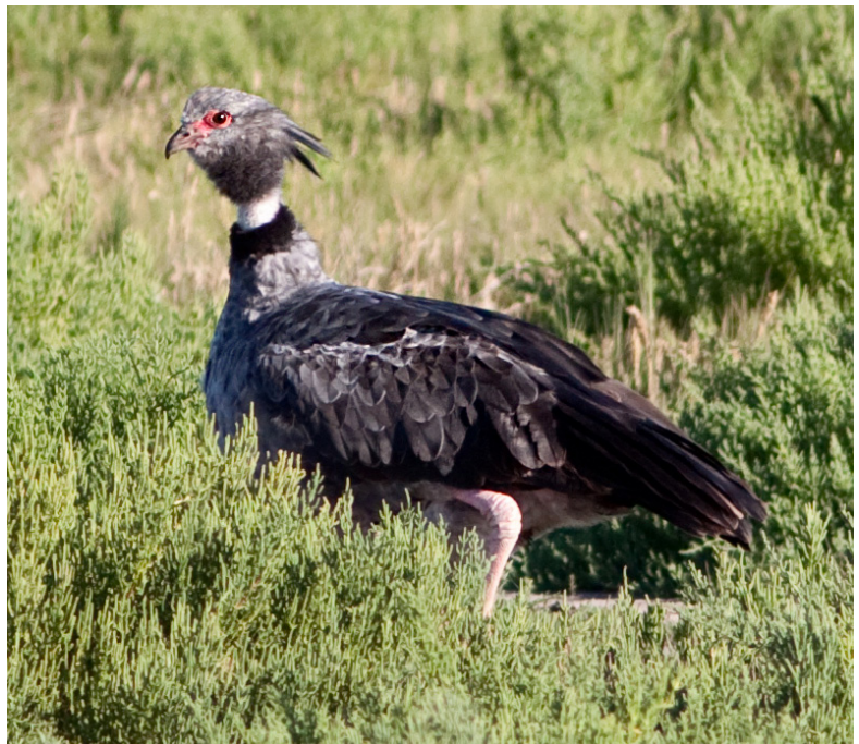
Southern Screamer.

Although shared with all of its neighbors, the Chaco is most associated with Paraguay and covers a huge area in the western half of the country. It is a hot and harsh environment in summer (October-March), yet much cooler in winter (June-August); the rainy season is October and November. Chaco woodland is not necessarily tall and is dry and often deciduous. There are open grasslands and ephemeral wetlands. This is an area that is fascinating for wildlife but is increasingly being converted to agriculture. Sustainable tourism could have a real impact in its conservation. In contrast to the drier western Chaco, the eastern portion of the Chaco, closest to Asunción,