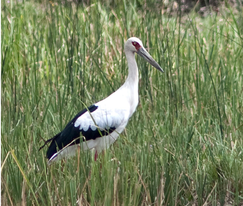
Maguari Stork.

elements, please inquire with your tour operator.