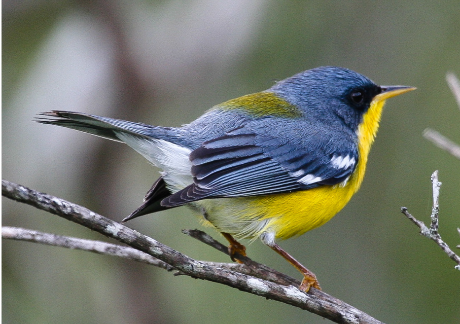
Tropical Parula.

is moister and known as the Humid Chaco, where Palm Savanna is common. There are many specialty birds of the Chaco including the Quebracho-crested Tinamou , Black-legged Seriema , Spot-winged Falconet , Black-bodied Woodpecker , Chaco Owl , and Crested Gallito . With some luck and local knowledge, a visit to this area al-