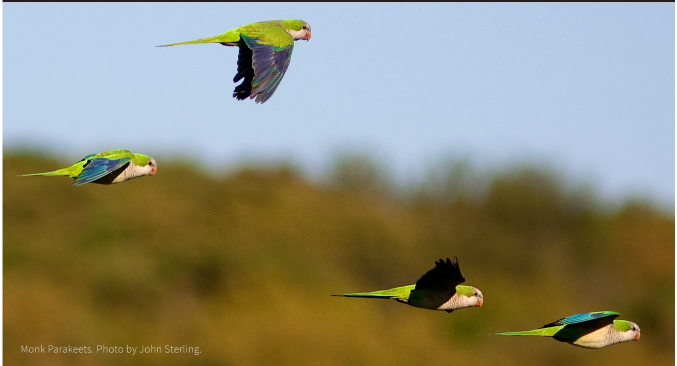
Monk Parakeets.