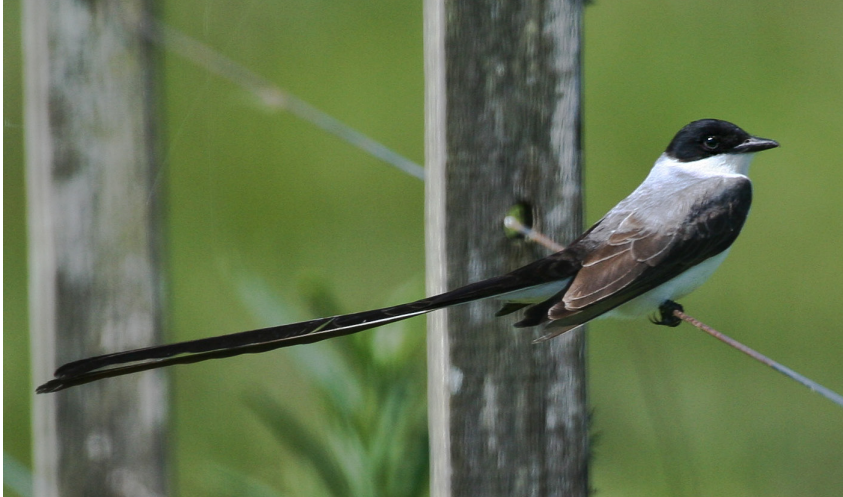
Fork-tailed Flycatcher.

the Mbaracayú Reserve. Overnight in Mbaracayú Reserve.