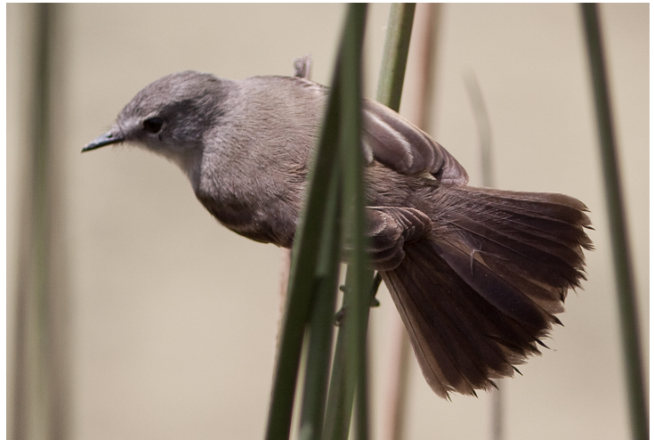
Sooty Tyrannulet.

This itinerary incorporates something special, and that is the opportunity to make you a partner in helping international conservation. The National Audubon Society and Guyra Paraguay , have teamed up to train local people in several parts of the country to become birding and nature guides. In addition to our primary guide, we will have their guiding help throughout this trip, and in turn are helping them make a living while protecting a