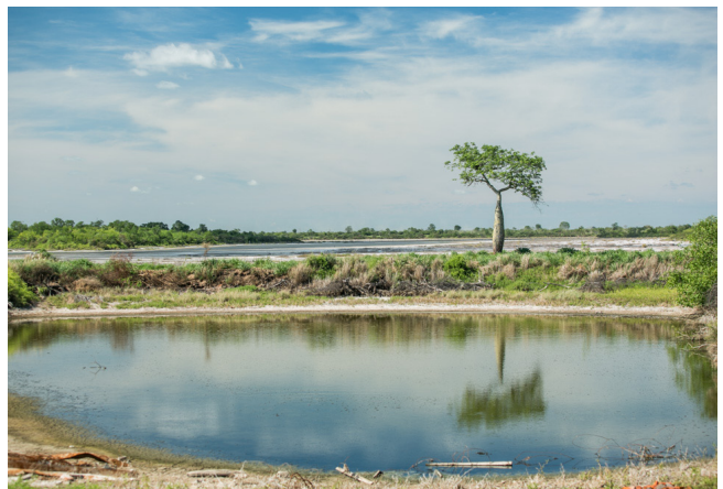
Lagunas Saladas.

Paraguay is an incredible and undiscovered birding destination, particularly for the birder with a pioneering spirit, interested in adventure. This is the one place in South America where we may find large wild mammals including Jaguar, Lowland Tapir, Capybara and a variety of other mammals along with many birds. This is the country where you can sense the adventure of unexplored, unspoiled and remote wild sites, where you will venture to areas that few outsiders have seen, where living native culture thrives, and where some superb birding adventures await. Anyone interested in South American birds needs to come to the heart and center of the bird continent to appreciate the diversity and evolutionary history of South American birds. Here is a confluence of eco-regions: the Chaco in the west, the Atlantic Forest in the east, as well as influence of the Pantanal in the north, Cerrado of Brazil, and Mesopotamia of Argentina. The separation of the Atlantic Forest from Amazonia by