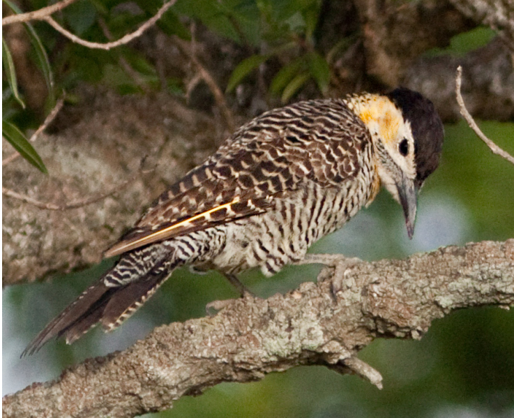
Campo Flicker.

an appearance. This rare and awe-inspiring raptor is widespread in the Chaco. During a night drive, we have a decent chance to see the Lowland Tapir , Greater Hairy Armadillo , and even three species of peccary including the legendary Chaco Peccary , a species only known from the fossil record until rediscovered in recent times.