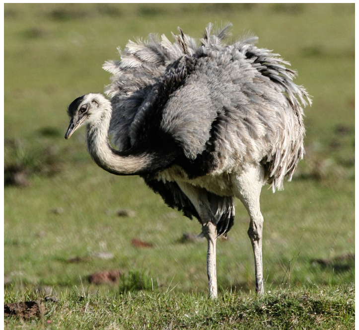
Greater Rhea.

This reserve protects high quality Atlantic Forest and is a desirable destination for birders visiting Paraguay. With over 400 species , the rich forest is pristine enough to provide habitat for Jaguar and Tapir , although rarely seen. Special birds of this area include Black-fronted Piping-guan , Helmeted Woodpecker and the spectacular sounding Bare-throated Bellbird . Also here is the Saffron Toucanet , known as the ‘ flying banana ’, as is its darker plumaged relative the Spot-billed Toucanet . Restricted to this part of the world are other large and colorful species including Red-breasted Toucan , Purplish Jay , Rufous-capped Motmot , Surucua Trogon , Yellow-fronted Woodpecker , and a host of parrots and tanagers. The drab but always interesting flycatchers