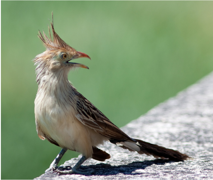
Guira Cuckoo.

and even some rarer species such as Ocellated Poorwill , Black-banded Owl and the Silky-tailed Nightjar .