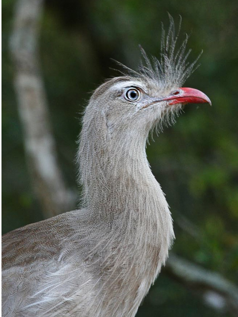
Red-legged Seriema.

tor and the Lesser Nothura, which is threatened and a near endemic to Brazil. Other specialties of the site are the White-rumped Monjita , White-rumped Tanager and the White-banded Tanager (a tanager that looks like a shrike). While night birding, we may come across Rufous and Little nightjars , the fantastic Scissor-tailed Nightjar , Tropical Screech-Owl and Common Potoo . At night, Crab-eating Fox is possible, and maybe even the amazing Maned Wolf , as well as armadillos and Collared Peccary . The moist grasslands could provide a diversity of seed eaters , including the rare Chestnut, Marsh, Dark-throated and Plumbeous . Also in this area we may find some other stunning birds such as Sharp-tailed Grass-Tyrant , Bearded Tachuri and Black-masked Finch .