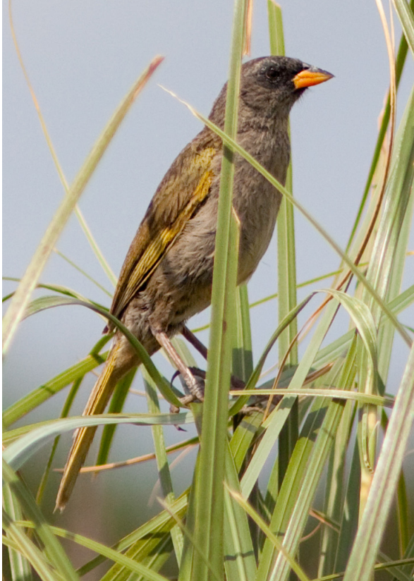
Great Pampa Finch.